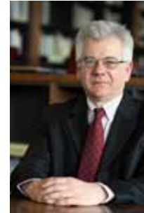
Prof. Jacek Czaputowicz, Director of the National School of Public Administration

The National School of Public Administration (KSAP) is an institution whose ultimate goal is to actively support efforts to modernize the Polish administration by means of: full-time studies, lifelong learning, analytical-research projects, and cooperation with institutions in other countries.